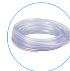
Condensate drainage hose 5501-0006 12 x 2mm