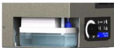
CD 15 with automatic pump

Fitted with a bracket for fast and simple wall mounting it is ideally suited for use in water management facilities, car storage, preservation, museums, archives, cellars, spas, domestic use and more.