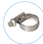
Hose clamp drainage hose 5404-0059 12 x 2/15 x 2mm